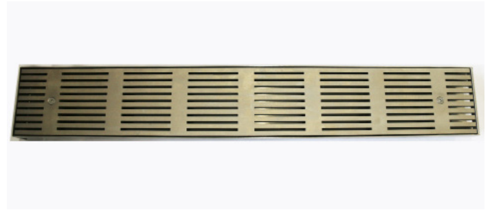
HD Heel Guard Cover Sample

Classification of slip potential surfaces in wet and dry conditions are according to 'The Assessment of Floor Slip Resistance: The UK Slip Resistance Group (UKSRG) Guidelines issues 4 / 2011'. Results are obtained from tests carried out by our trained laboratory technicians in the internal laboraboraty. All figures are measured and expressed under laboratory conditions: Actual performance may vary from the above values depending upon site conditions. Contact the Technical Sales team for the actual slip resistant values or more information about the UKSRG.