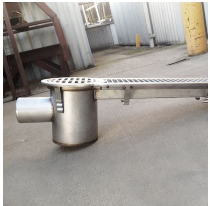
Summit End Side Drain Outlet Sample