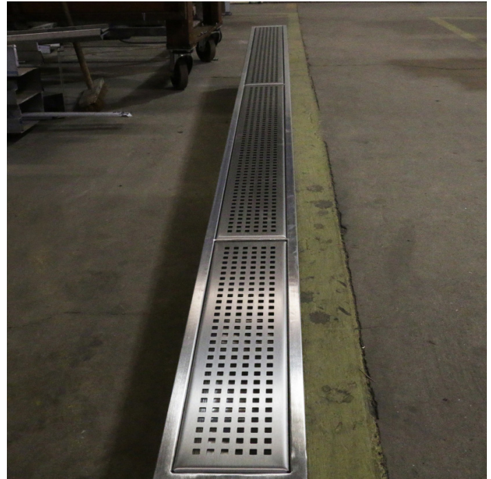
Shower drain Cover Sample

Many factors affect the choice of cleaning method and frequency of its application. Suitable methods for stainless steel are: water and steam; mechanical non abrasive scrubbing; organic solvents and mild detergents.