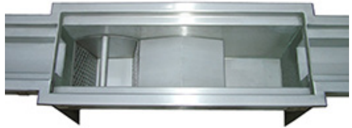
Meribel Central Outlet Sample

Many factors affect the choice of cleaning method and frequency of its application. Suitable methods for stainless steel are: water and steam; mechanical non abrasive scrubbing; organic solvents and mild detergents.