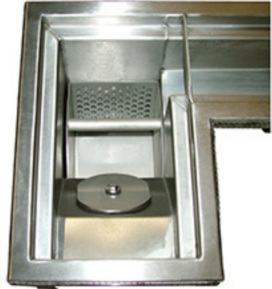
Diamond End Bottom Outlet Sample

Many factors affect the choice of cleaning method and frequency of its application. Suitable methods for stainless steel are: water and steam; mechanical non abrasive scrubbing; organic solvents and mild detergents.