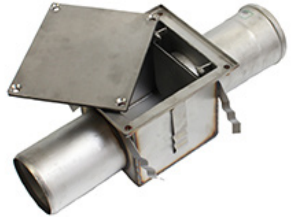
Anti Backflow Valve Sample

For advice regarding the most suitable ASPEN Stainless for you please contact our technical sales team today to discuss your requirements.