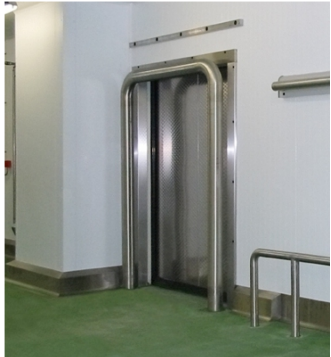
Goal Post with radius corners illustration

Many factors affect the choice of cleaning method and frequency of its application. Suitable methods for stainless steel are: water and steam; mechanical non abrasive scrubbing; organic solvents and mild detergents.